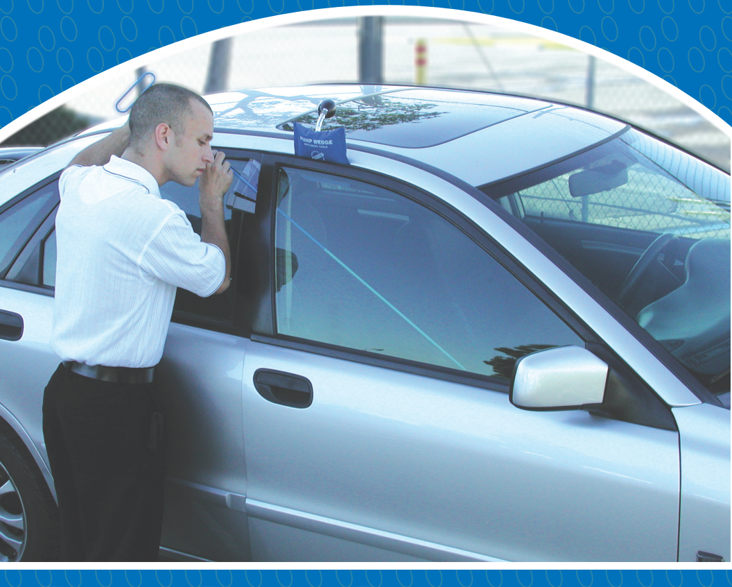
Tel: 714/633-0681 • Fax: 714/633-0470